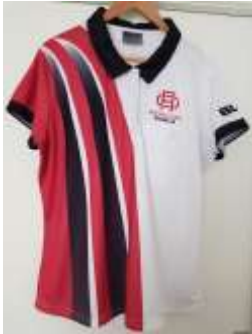
Club Shirt $50