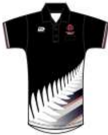
Alternative Shirt $50