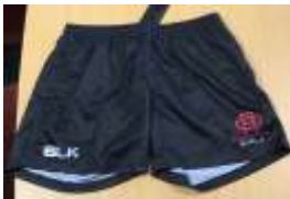
Club Shorts $50