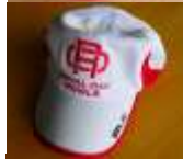
Club Caps $20