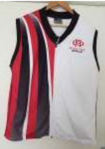
Club Vest $30