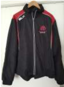
Club Jacket $85