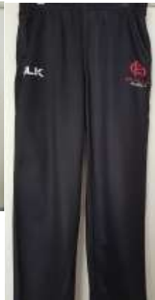
Club Pants $60